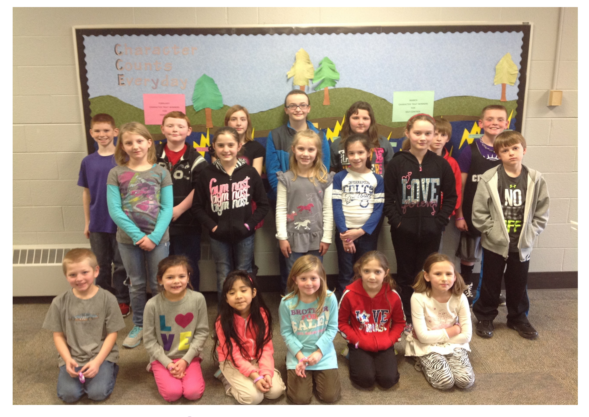
MARCH CHARACTER TRAIT WINNERS SELF-CONTROL