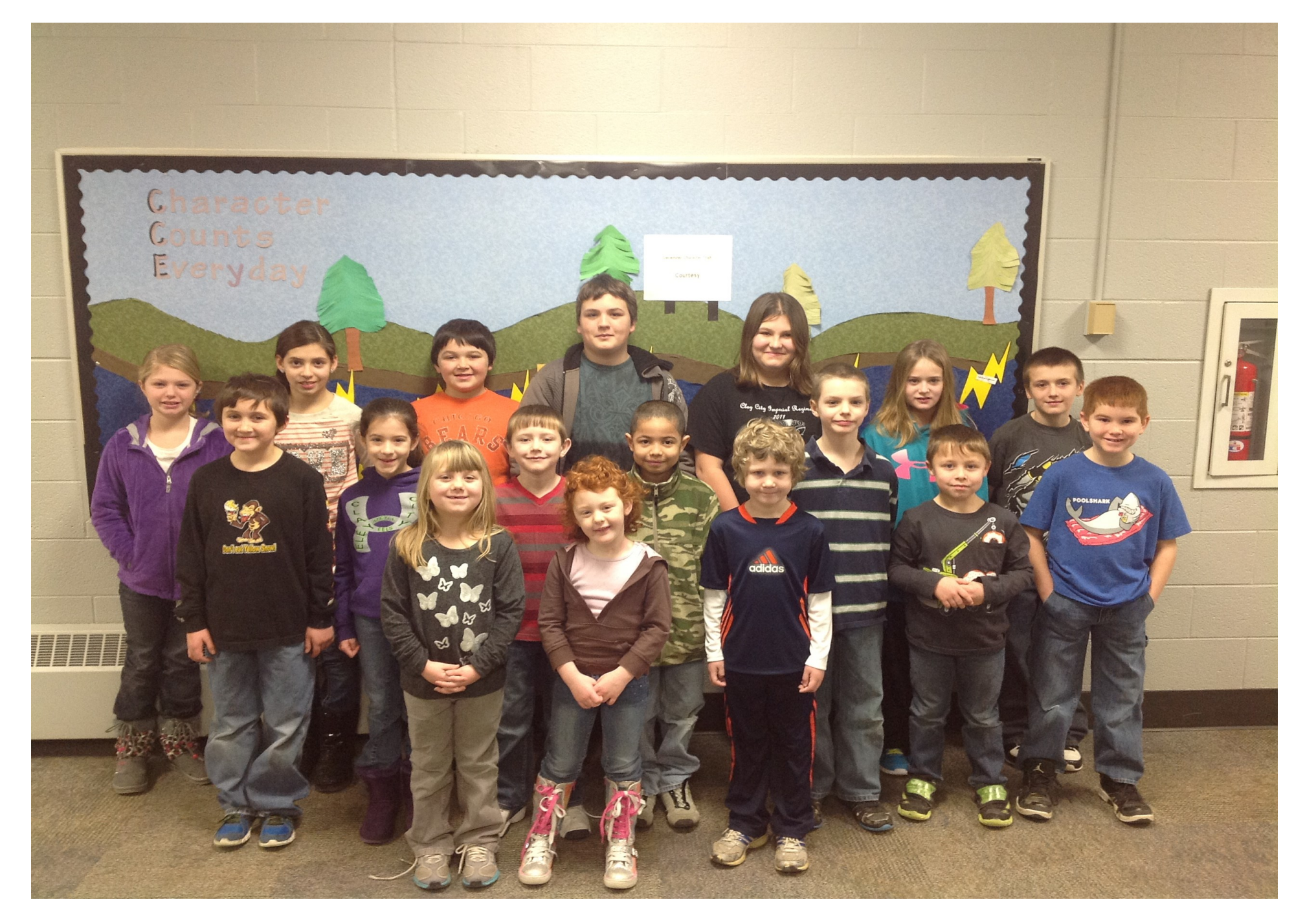
December Character Trait Winners Courtesy