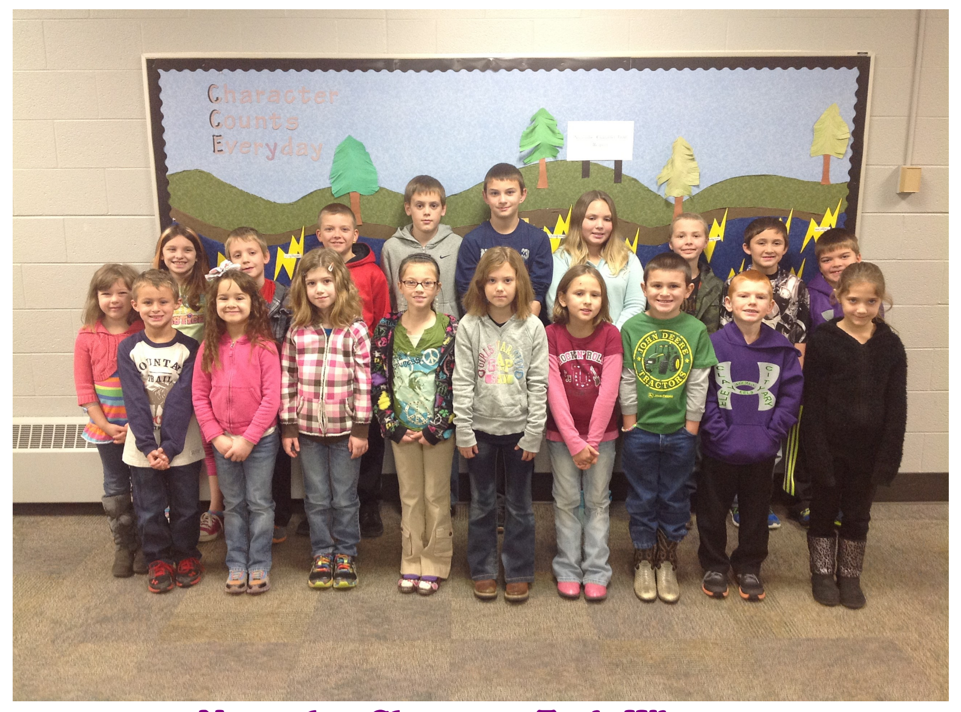
November Character Trait Winners Respect