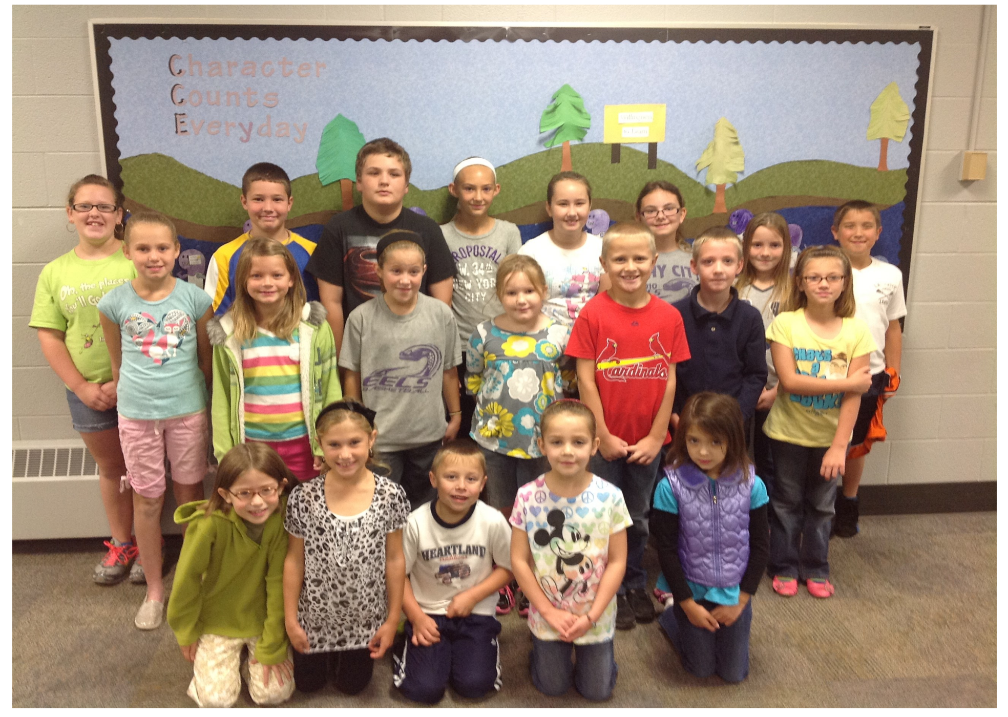
SEPTEMBER CHARACTER TRAIT WINNERS RESPONSIBILITY