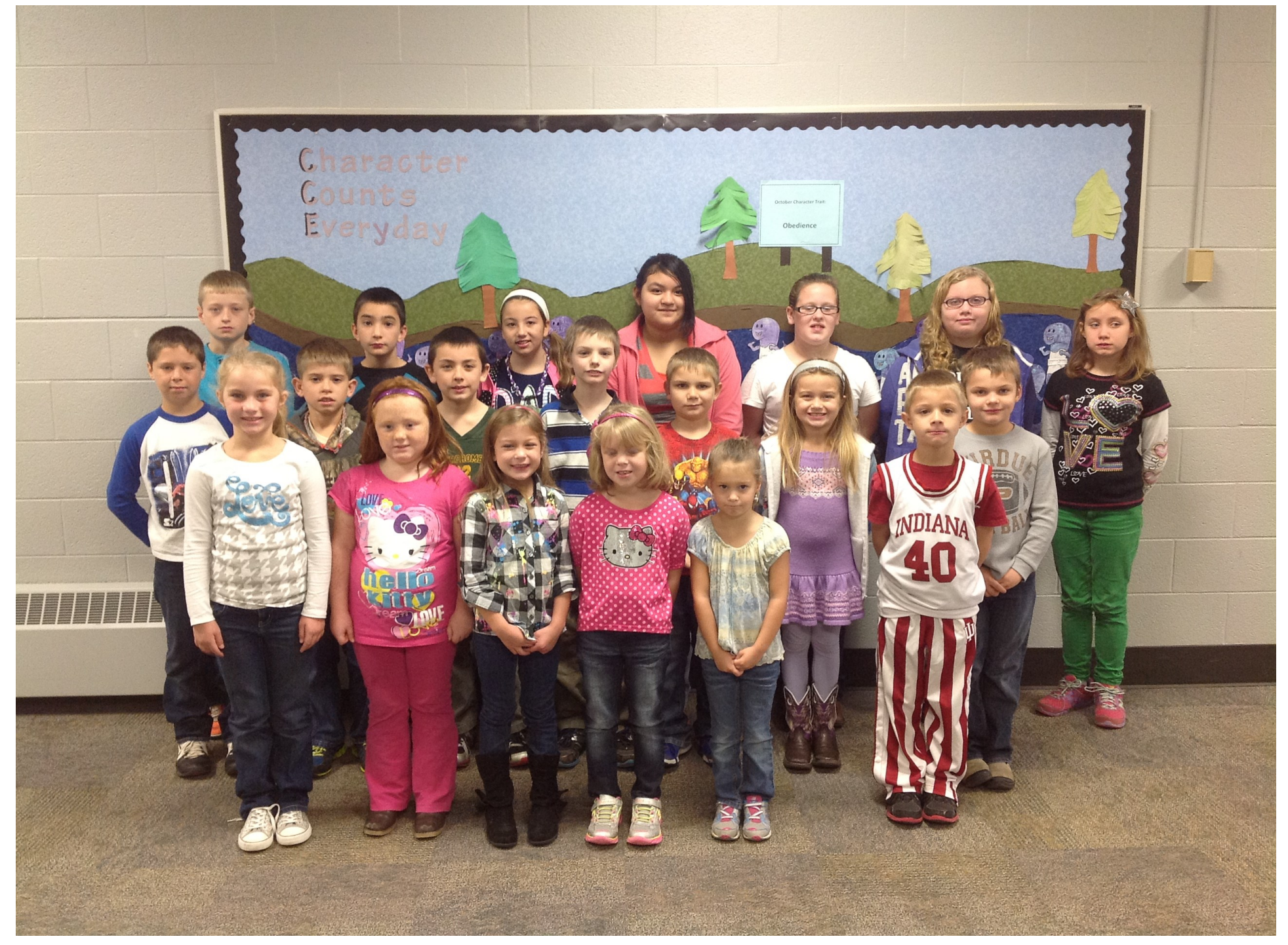
OCTOBER CHARACTER TRAIT WINNERS OBEDIENCE