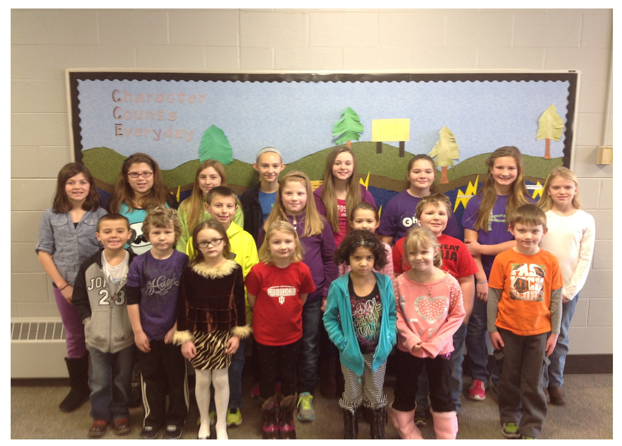
January Character Trait Winners Accountability