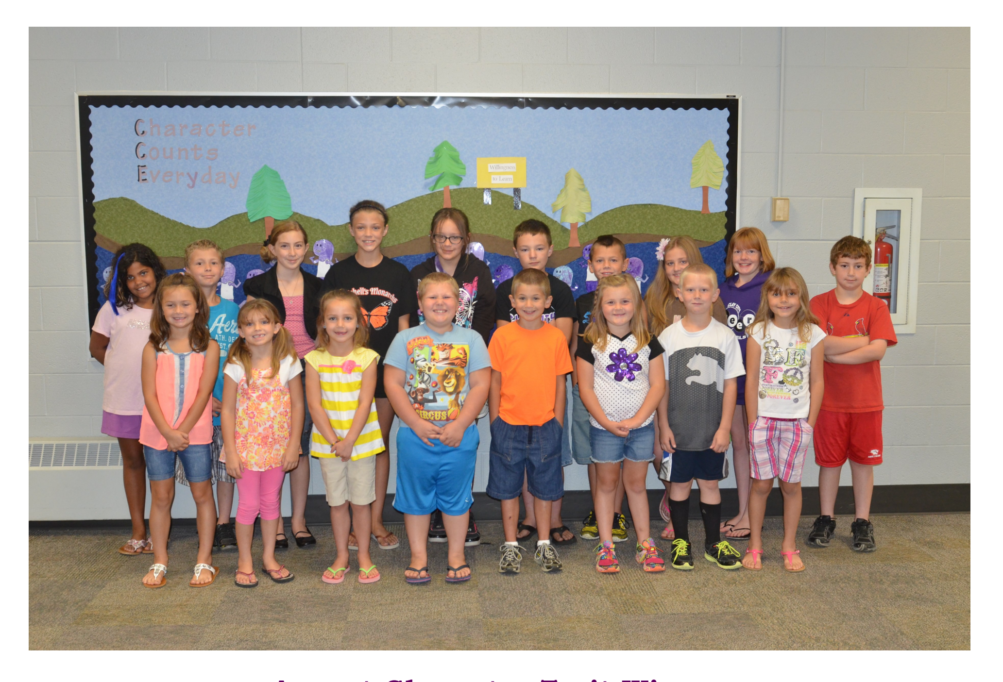
August Character Trait Winners Willingness to Learn