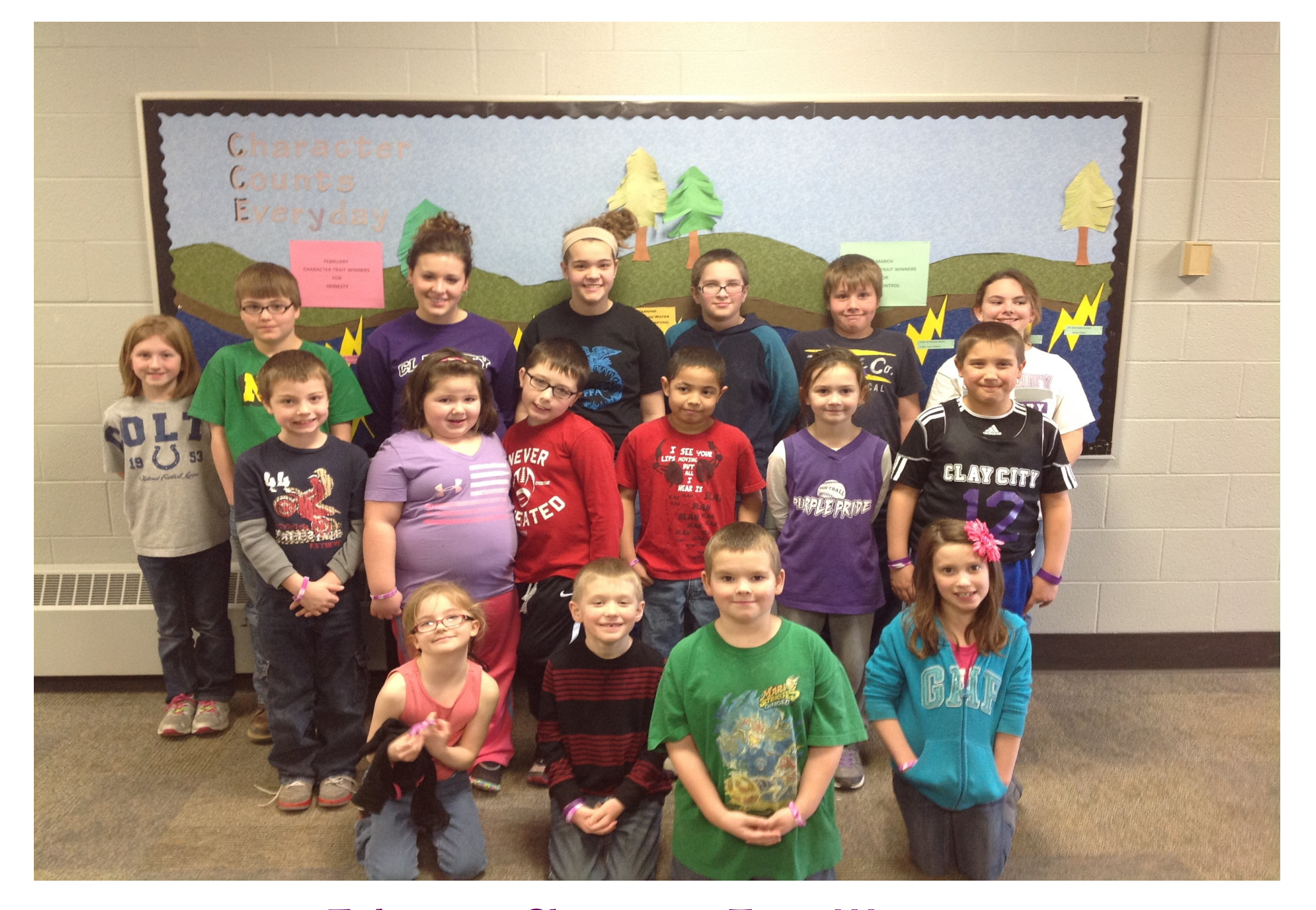
February Character Trait Winners Honesty