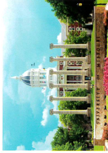
University of Missouri-Columbia

Free Workshops, Free Brokerage Accounts, and Free Study Abroad provide recipients with a practical understanding of important life skills not typically covered in the school curriculum.