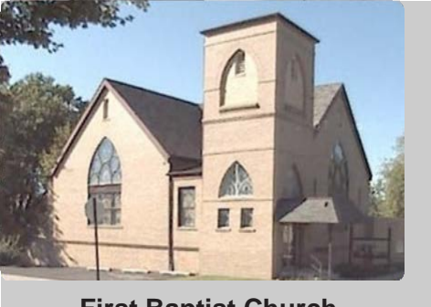
First Baptist Church 413 South Walnut Street Brazil, IN 47834 812.448-8112