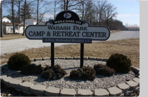
Wabash Park & Retreat Center 304 East County Road 650 South Clay City, IN 47841 812.240.9405

cradlescc@gmail.com Check us out on Facebook at 'Clay Cradles'