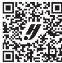
Grad Products Catalog